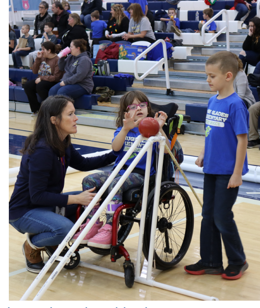
Above left: A student participates in a glass-blowing demonstration during a visit to Simon Pearce. Above right: Students take part in the Inaugural GCPS Unified Bocce Tournament held at Garrett College.